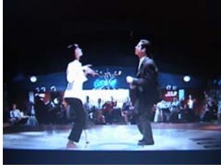
'Vincent Vega and Marcellus Wallace's Wife'