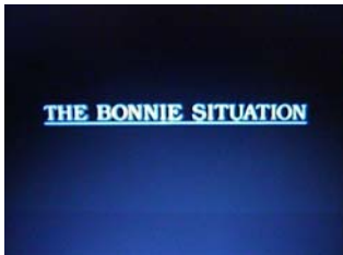
The Bonnie Situation