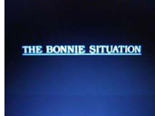
The Bonnie Situation