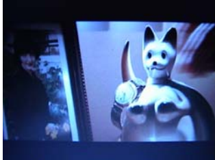
'The Gold Watch' (including death of Vincent)