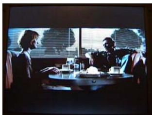
'Prologue' (Honey Bunny and Pumpkin in diner, up to the start of the robbery)