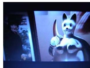
(Early section of 'The Gold Watch' with Butch's father's friend giving him the watch when Butch was a child)