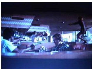
Epilogue (in the diner; during the robbery and its aftermath, taking us to a few minutes after the end of the Prologue)