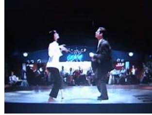
'Vincent Vega and Marcellus Wallace's Wife'